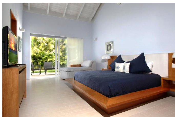
Villa Vogue (Casa De Campo): One of many amazing villas in Casa De Campo.